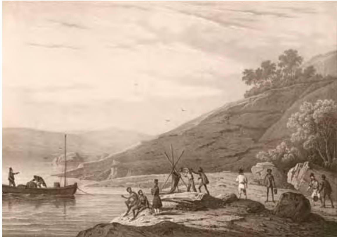
Louis de Sainson Taking on water – the Astrolabe – St George’s Sound 1826 lithograph on wove paper National Gallery of Australia, Canberra

Nyoongar culture from the earliest days of contact in the early 1800s until the present day. This is evident in New Water Dreaming 2005 (see p. 145), a direct reference from the hand-coloured lithograph produced by Louis Auguste de Sainson in 1826.