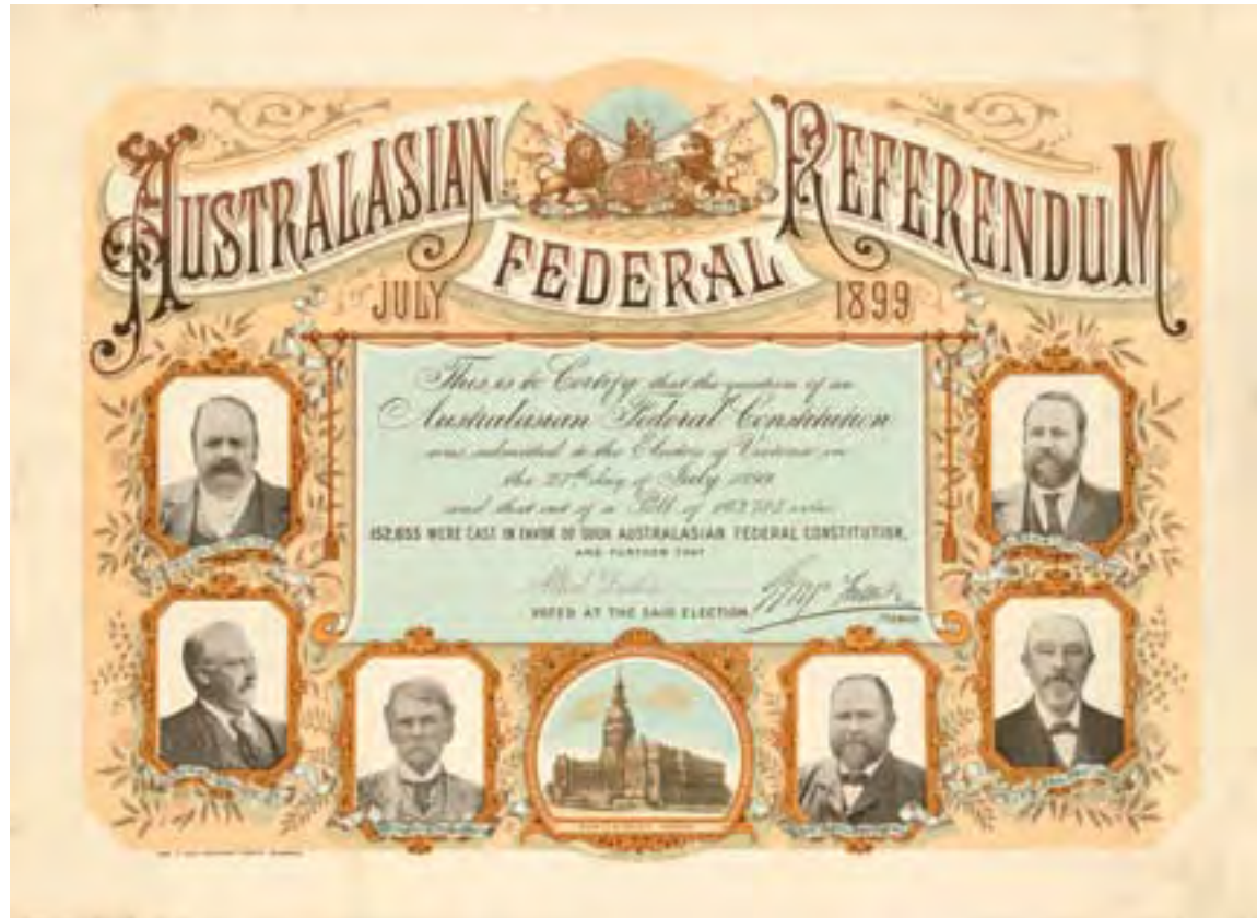
Australasian federal referendum certificate, 17 July 1899 National Library of Australia, Canberra, Manuscript Collection (MS1605)

although it was not an actual legislation but a generic term referring to a collection of historical laws and policies that were not abolished until 1973, under the Whitlam Labor Government. The topic of acceptable immigration has remained an incendiary political issue ever since, placed firmly back in the public arena in recent times by various public figures.