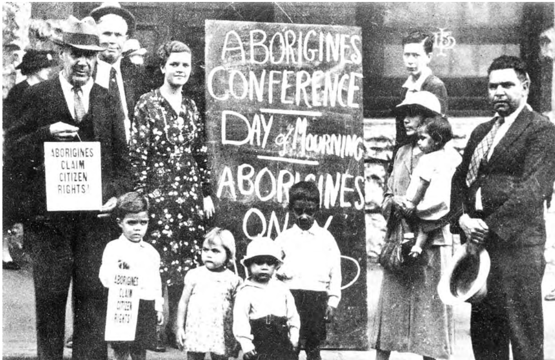
National Day of Mourning 1938

how would I feel if this were done to me? 14 President Chirac's official speech in June 2006 at the opening of the Musée du quai Branly, the newest international museum dedicated to the art and culture of the world's First Peoples, announced to guests from around the world (including Kofi Annan, then Secretary-General of the United Nations), echoed the tone expressed in former Labor prime minister Paul Keating's speech: