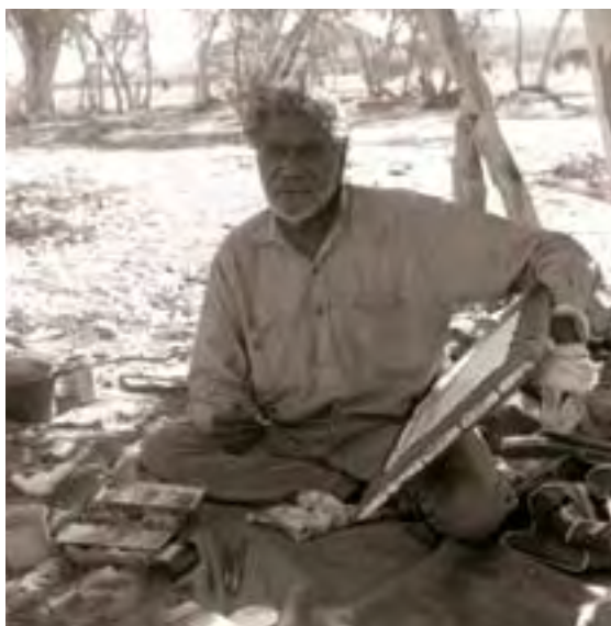
Frank H. Johnston Portrait of Albert Namatjira 1958

large-scale canvases. Her minimalist ground-scapes hypnotise with their apparently shifting perspective, using the most sparing of colours, as in Untitled 2007 (see p. 113). Although seemingly far-removed in style, all of these Central Australian artists trace direct artistic and cultural links to the earlier innovative practitioners of Hermannsburg, such as Western Arrernte artist Albert Namatjira (1902–1959) and the earliest artists of Papunya, through their willingness to use unexpected colour and energetic brushstrokes to present their distinctive styles.