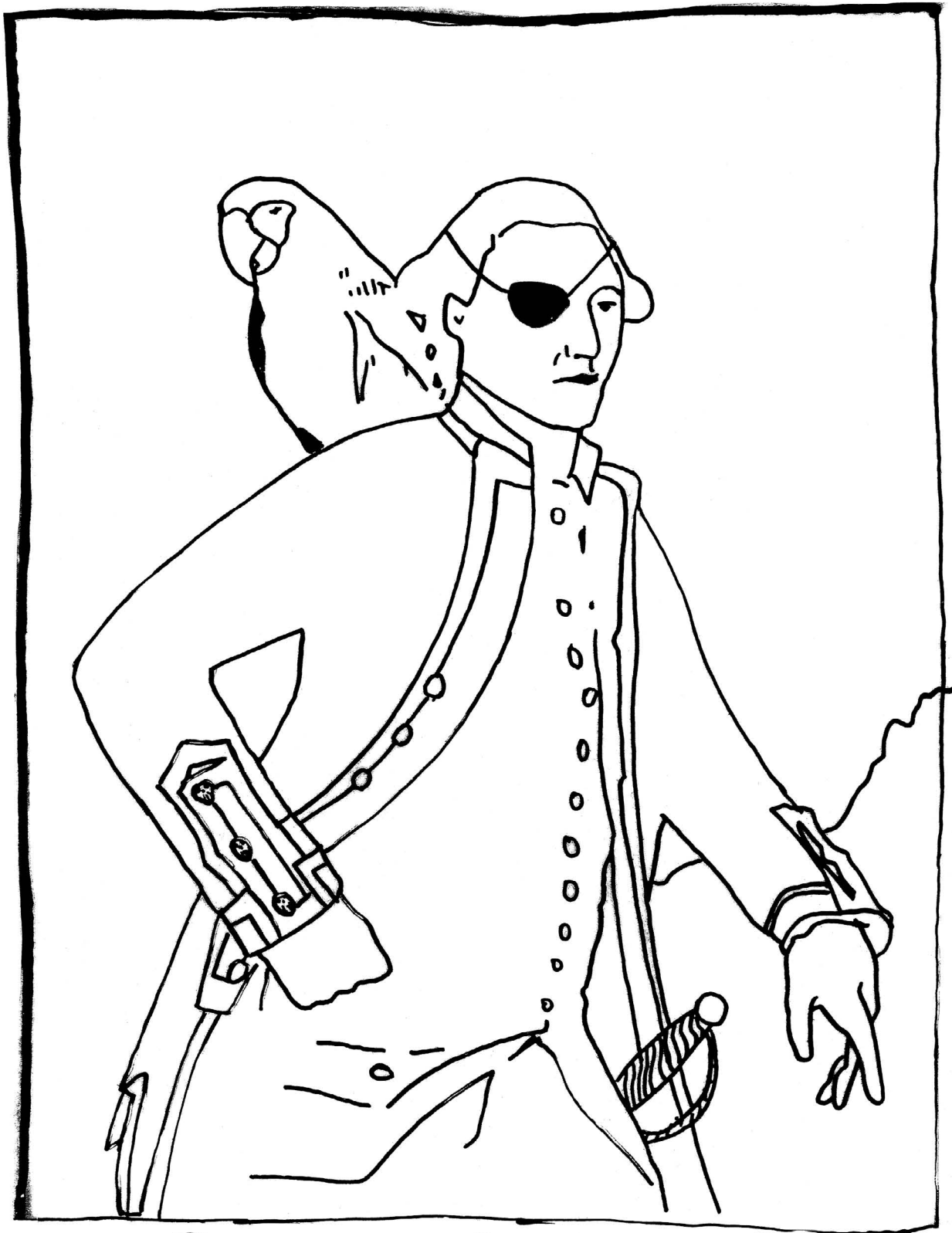
Captain No Beard